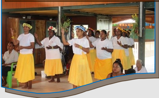
Nusabaruku Sisters of the Visitation Servants were delighted to honor Our Lady in the Visitation on Friday,

day, May 31, at Our Lady of Assumption Church in Nusabaruku.