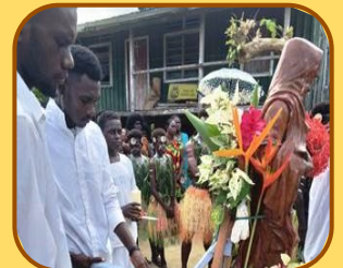
Sacred Heart Feast Day at Maleai village