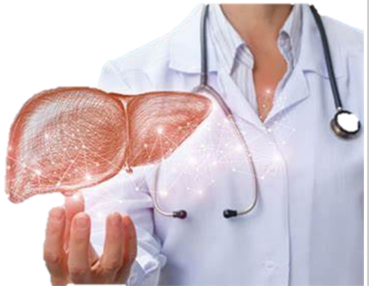
To be continue next issue