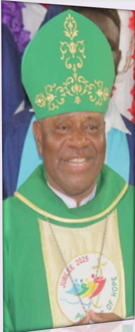
Bishop Peter Houhou

Pg1&2: Bp's P/ message. Pg3&4: Vatican News, Pg5: Education, Pg6: Youth / Education, Pg7: SD News, Pg8: ND News, Pg9: Health & coming Events.